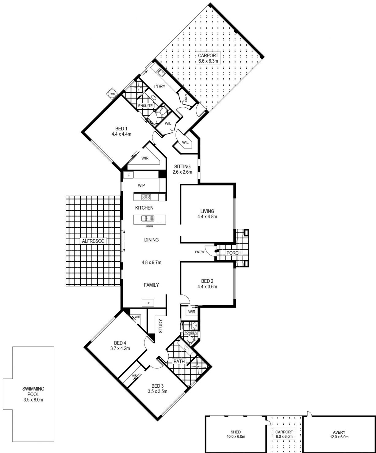
SHED/CARPORT/AVERY (NOT TO SCALE)